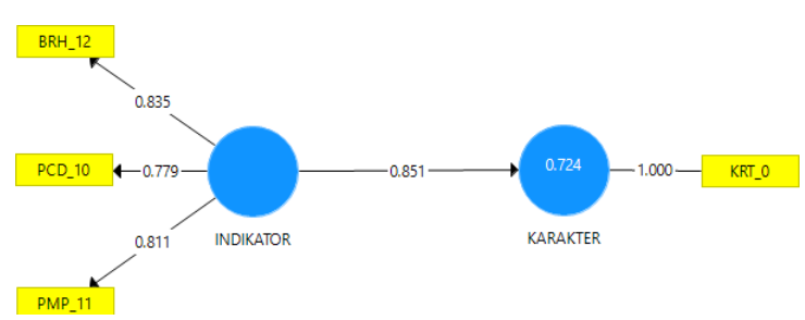
Figure 1. Character Theory marked by the valueof Leadership,Confidence,andKindnesswithascore of Factor Loading >0.7

Character values numbered 1 to 12 were achieved by32childrenthroughtheGACILgameinthevery well developed category. This means that the stimulation of the GACIL game has succeeded in growing basic character values in early childhood. The character values that become strong markers character theory are self-confidence, for leadership, and the child's kindness and humility. This can be seen from Figure 1. that the value of Leadership, Confidence, and Kindness with a score of Factor Loading > 0.7, while other indicatorsare < from 0.7 so that it does not become a strong marker of the character that grew from the game GACIL